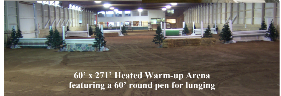
60' x 271' Heated Warm-up Arena featuring a 60' round pen for lunging