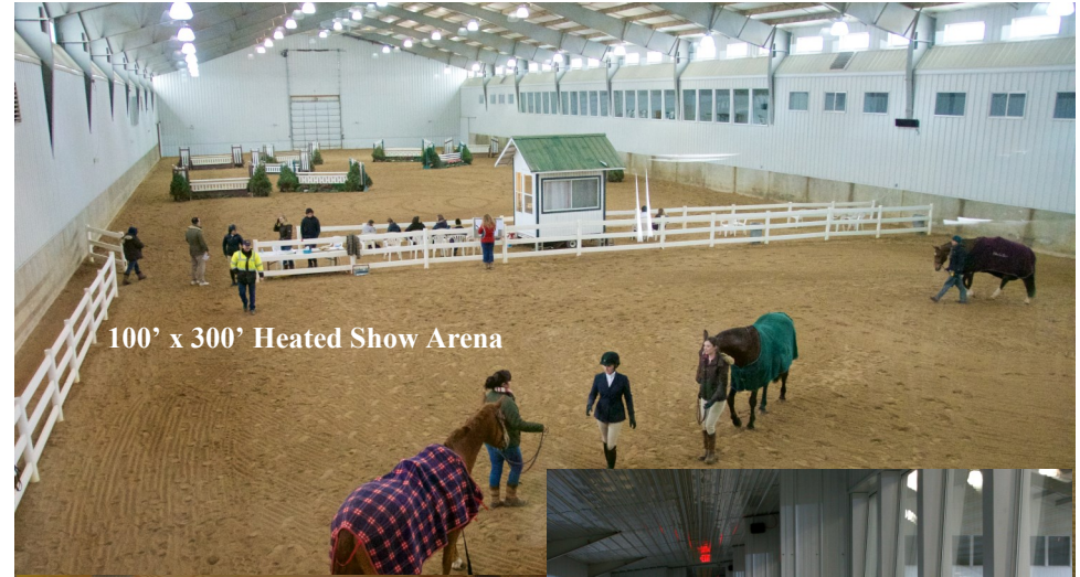
100' x 300' Heated Show Arena